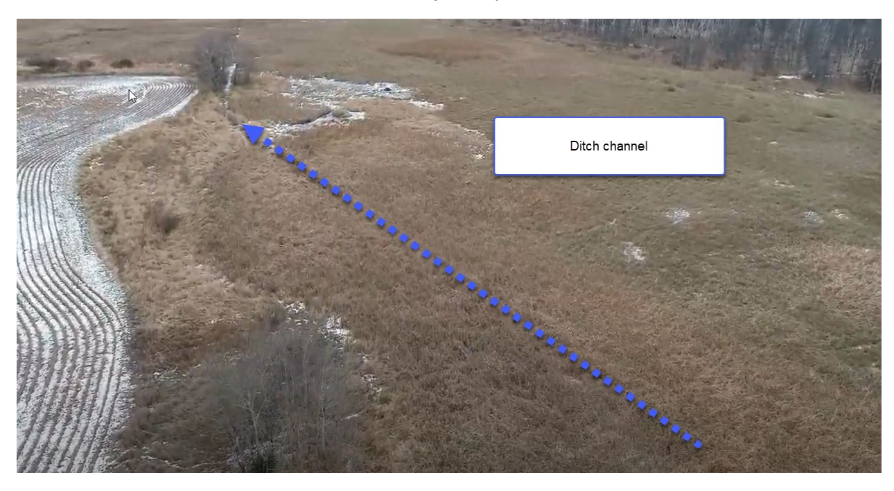
Area south of County Road 5

The area south of County Road 5 is known to hold water. The photo below is from a drone flight in 2019. The ditch from Co Rd 5 extending south for about 2,000 feet is considered Type 3 wetlands. Due to the presence of wetlands and financial impact of purchasing wetland credits to offset the negative impact to wetlands, the repair only focuses on removing vegetation